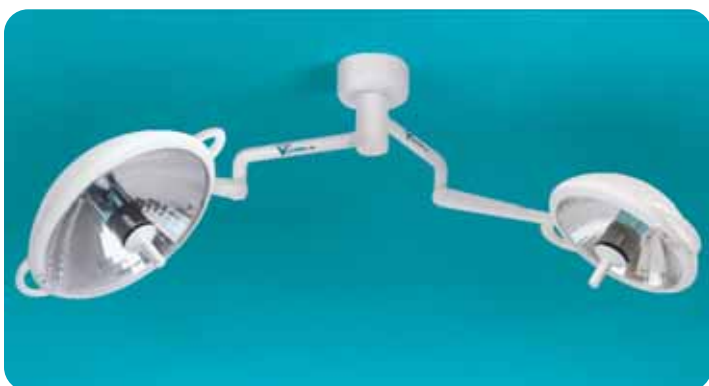
20-inch and 16-inch Light Head Combination shown

The single light mount can be configured to have either the 20-inch or the 16-inch light head. Both lights feature continuous rotation of all the joints combined with ultra lightweight, easy-to-position counterbalance arms making these lights ideally suited to the needs of minor surgery.