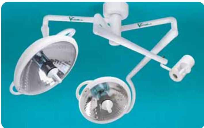
Camera shown with a 20-inch and 16-inch Light Head Combination

The dual light offers the flexibility of being set up with dual 16-inch or 20-inch light heads or a combination of both. The intensity of these lights combined with their excellent shadow control, variable pattern size and back-up bulb makes them an extremely popular choice for trauma and ambulatory surgery applications.