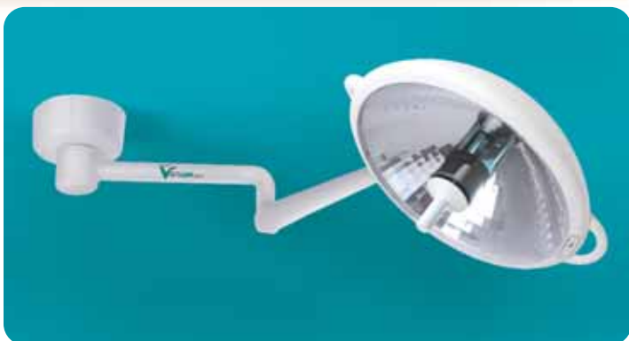
20-inch Single Light Head shown