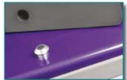
Extremely durable and easy-to-clean PLUS no hard-to-clean Velcro