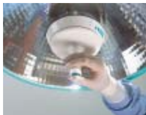
Multi-functional Sterile Handle