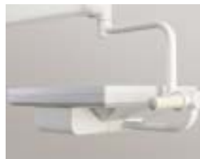
Flat-folding Monitor Storage

NUVO Surgical Equipment – thoroughly-tested, industry-refined, proven results.